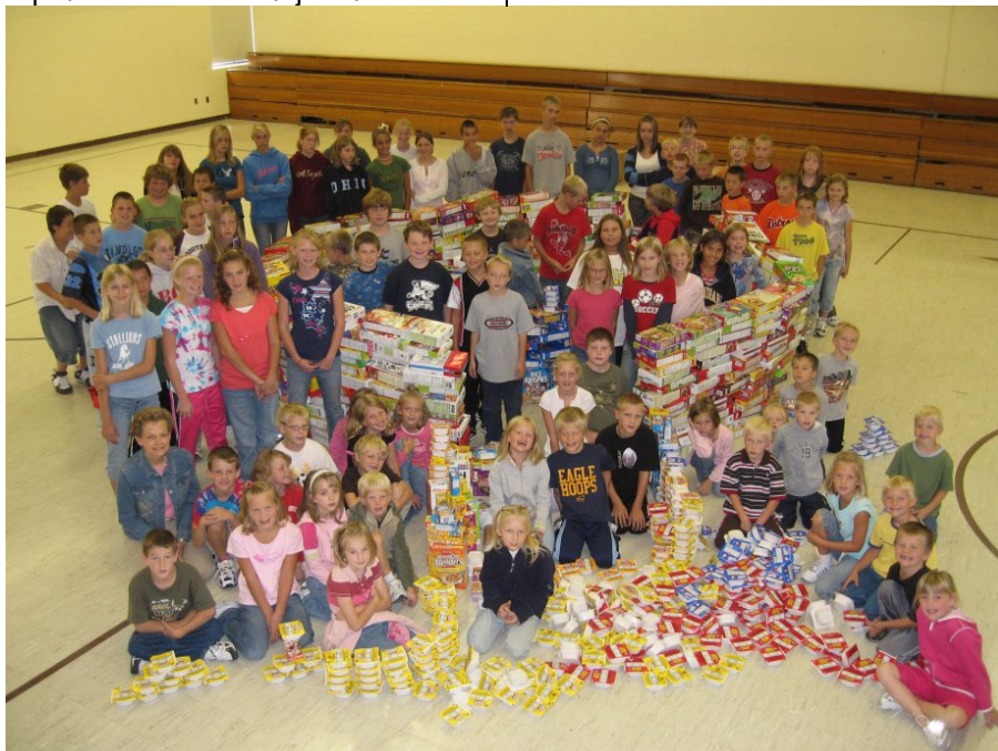
This picture shows our students and the results of the cereal drive held in September of this year. This year the Beaverdam students and staff collected 702 boxes of breakfast cereal which we donated to His Harvest Stand.

Finally, the school flagpole has been repaired and repainted. An anonymous volunteer repaired the flagpole, while the eighth grade repainted it. Thank you for your efforts to allow Beaverdam Christian School proudly display the American flag.